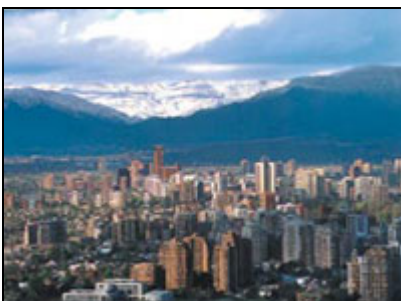
Santiago de Chile