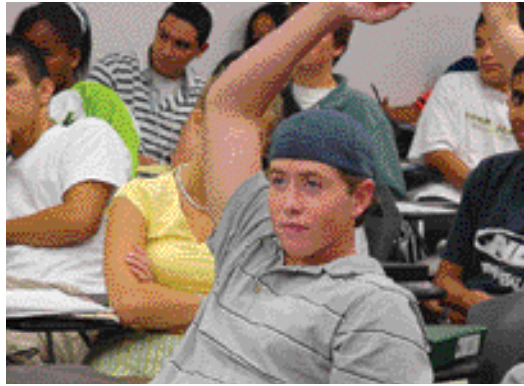
Students of the Summer Scholars course Healthcare: A Process of Health Promotion, Maintenance, Rehabilitation, and Preventative Medicine.